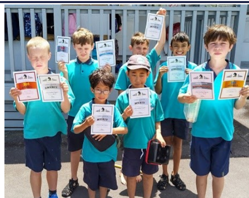
Chess at Jireh Christian School—well done players!