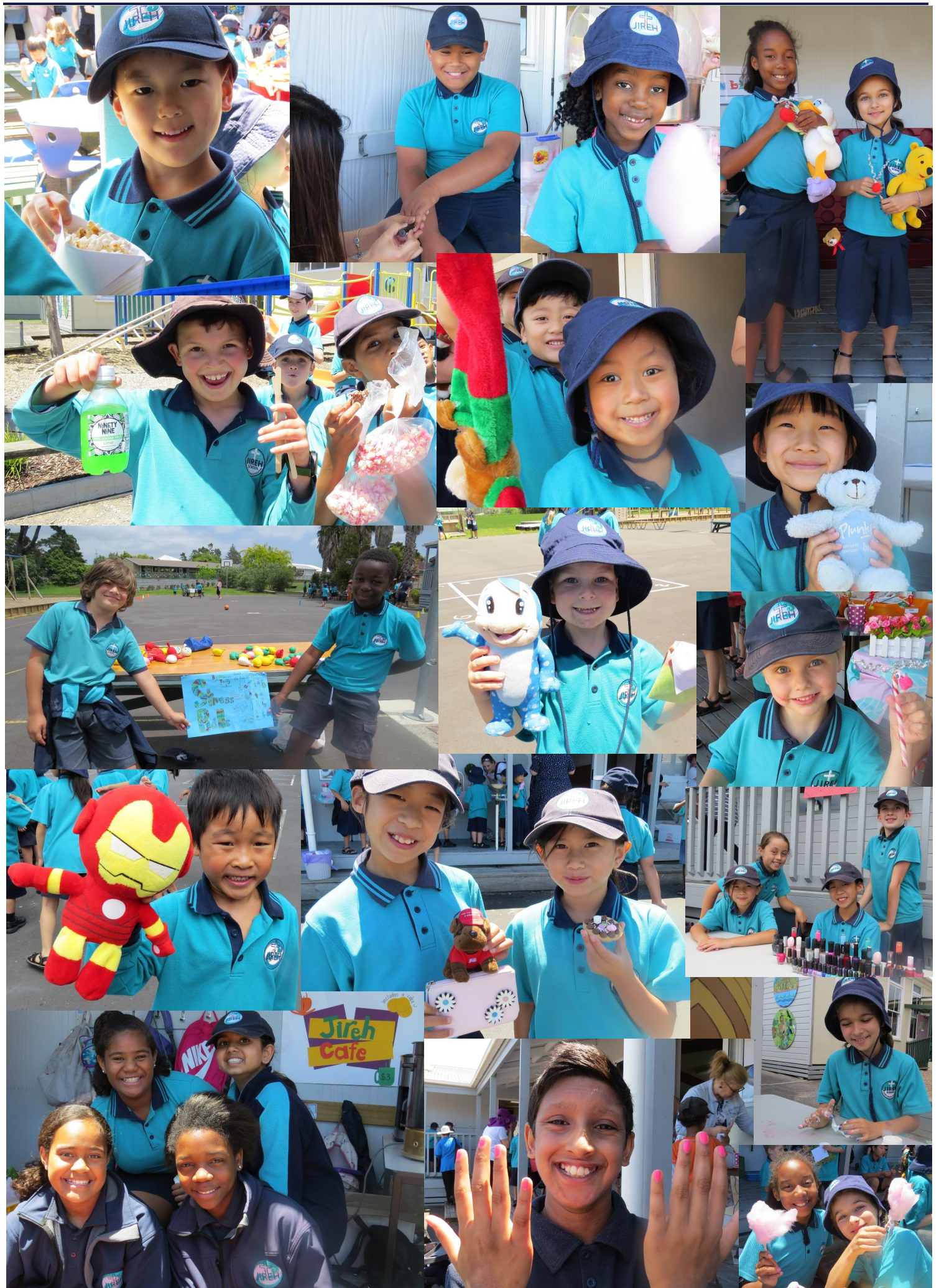
'We are a Christ centred community where learners are nurtured to glorify God'