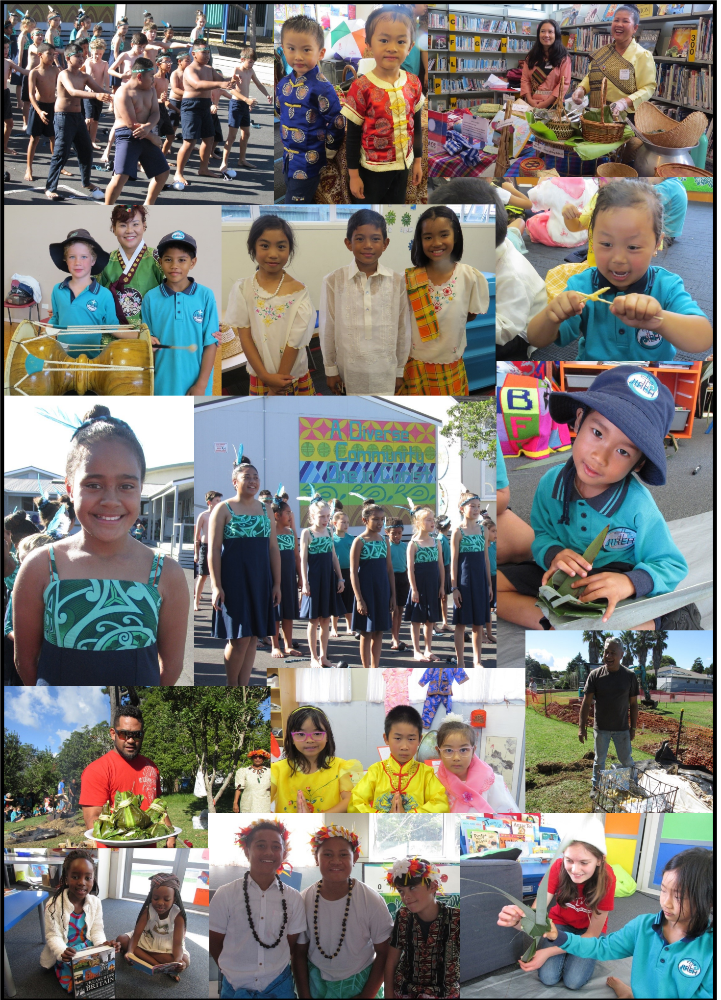
'We are a Christ centred community where learners are nurtured to glorify God'