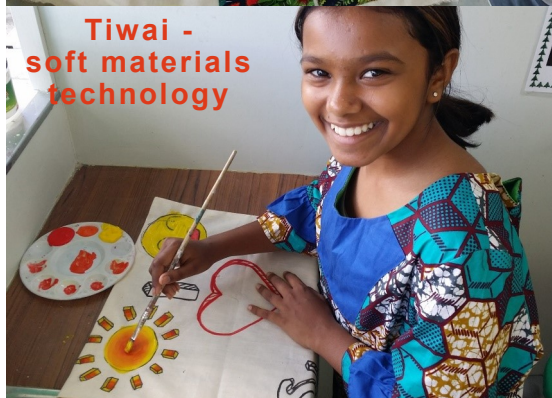
Tiwai - soft materials technology