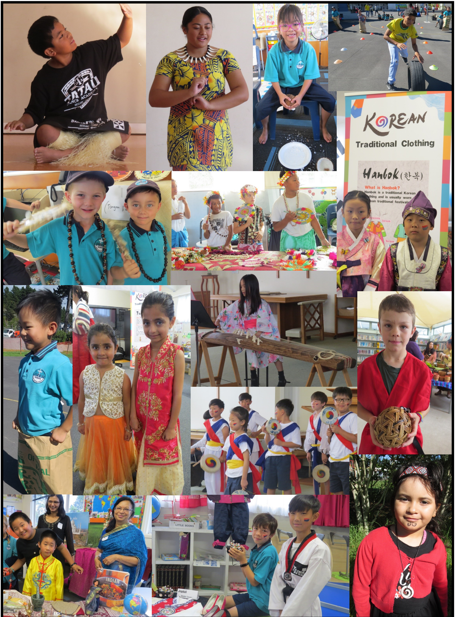
'We are a Christ centred community where learners are nurtured to glorify God'