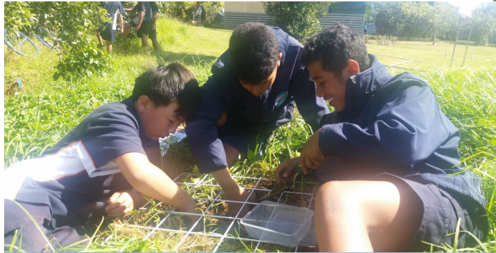
Tiwai using quadrants to explore living things