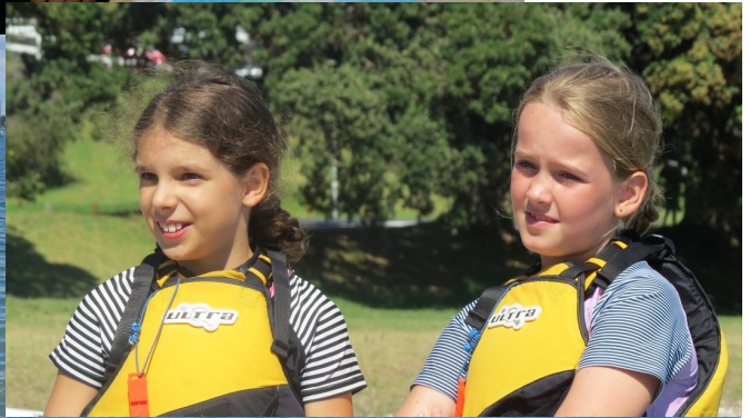
Tiwai Team Challenge Day