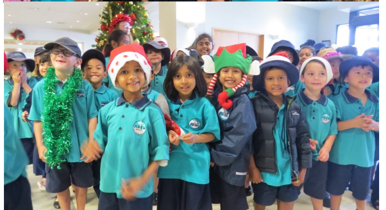
Jireh Angels spreading God's Love at Selwyn Village and enjoying a picnic at the park afterwards.