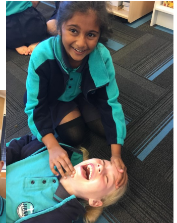
Chickens and Humans alike enjoying Happy Hatch Day!